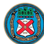
CANTON PUBLIC SCHOOLS