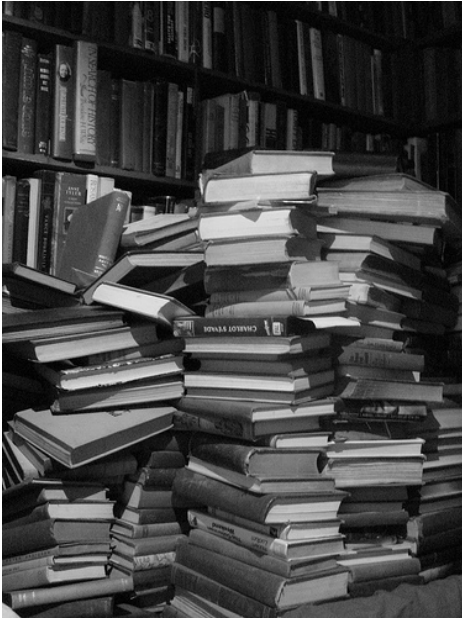
So many books returned at once! ...